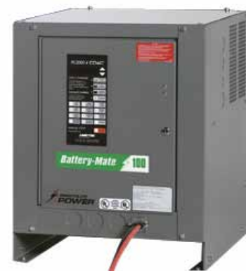
Typical forklift charging station examples