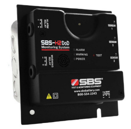
2-Gang Junction Box Hardwired AC and/or DC (optional)