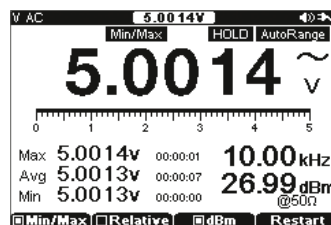
Voltage data logging screen shot