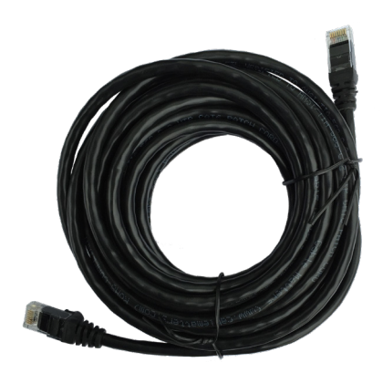
Cat5 Cable (25 ft std., 50/100 ft optional)