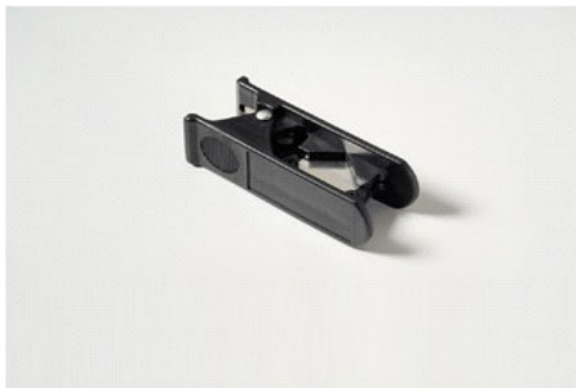
FLT-012 Tubing Cutter