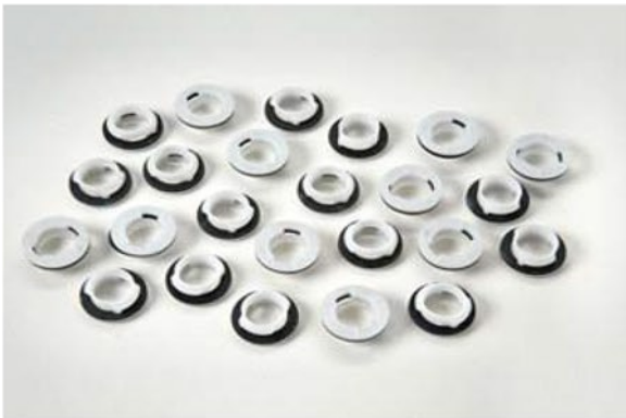
INJ-656 Quarter turn vent adapter (24 pack)