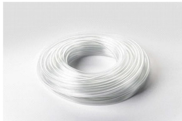
FLT-072 1/4" OD Tubing for Push-fit grippers for Stealth & Spider Systems