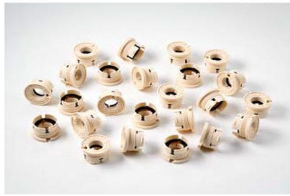
INJ-458 DIN Vent Adapter 24 pack