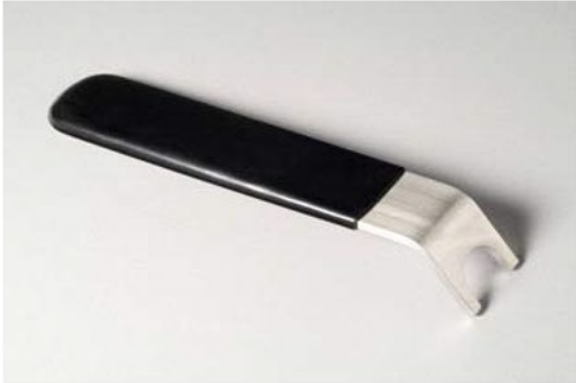
INJ-601 Collar Installation Tool