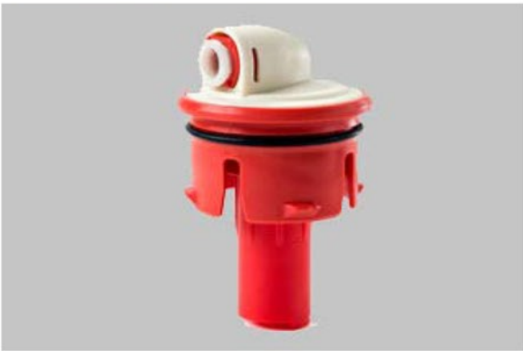
INJ-LP1D Water Injector Spider, for DIN Vent Openings