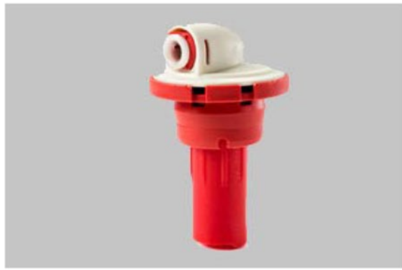
INJ-LP1 Injector Spider, Loose