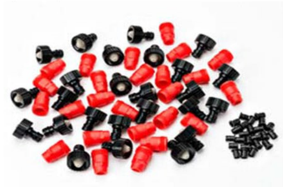
INJ-CP25 Quick-Connect Input Coupling for Water Injectors™ (25 pack)