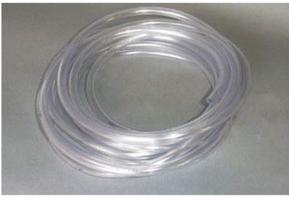
INJ-198 Tubing, 25 feet 1/2" OD