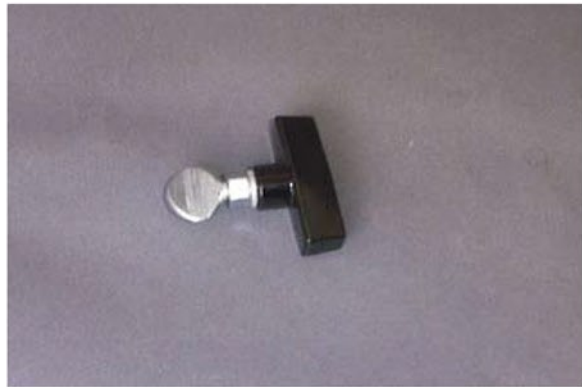
INJ-WR Quarter Turn Wrench