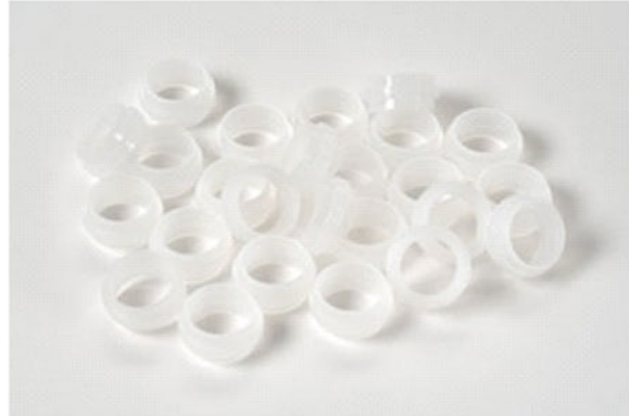
INJ-608 Collars for Water Injectors & Stealth Systems (25 Pack)