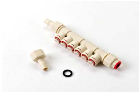
INJ-670 6 Port Inline Manifold for Injector Spider Systems