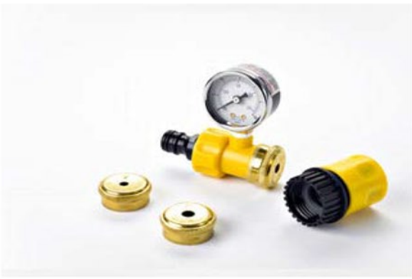
INJ-FC Flow Checker, for testing output pressure compatibility