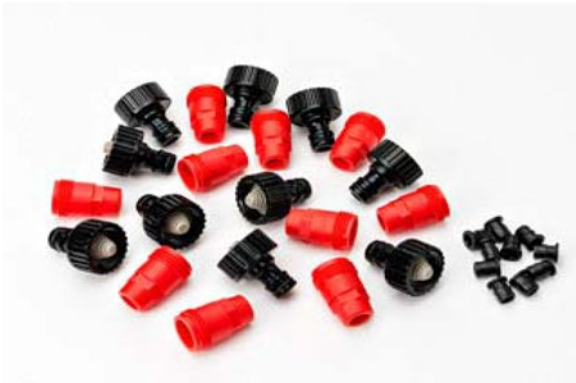
INJ-CP10 Quick-Connect Input Coupling for Water Injectors™ (10 pack)