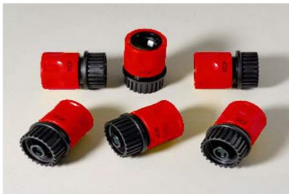
INJ-527 Quick-Connect FxF Thread (No Check Valve) (6 pack)