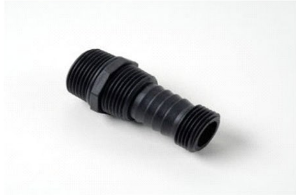
INJ-624 Barbed Fitting for INJ-540 pump