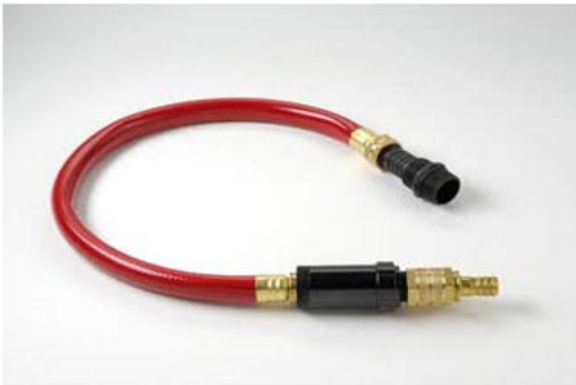
INJ-645 Inline Regulator Assembly (for use inside the tank)