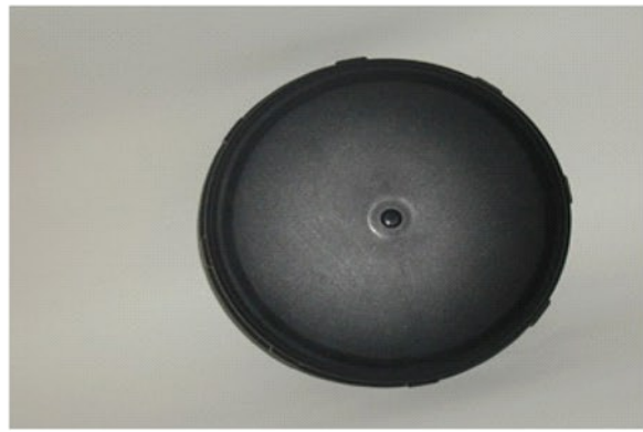
INJ-562 Tank Cap, INJ-HCT serial number below 20111959