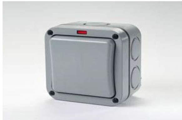
INJ-672 Switch, HydroCart Max (serial number 20111959 and higher)