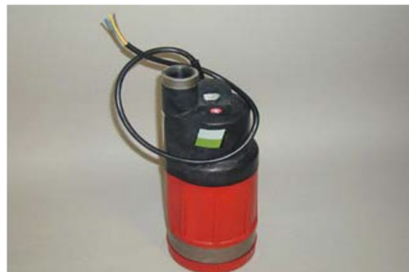
INJ-540 Replacement Pump for Injector Water Supplies