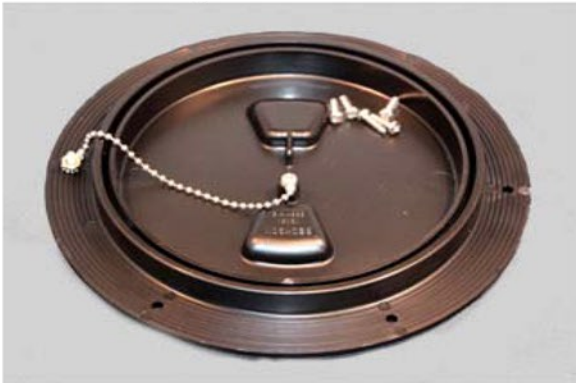
INJ-674 Replacement Cap, Chain and Rim