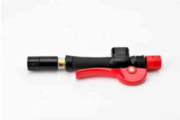
INJ-607 Instant Valve PRO