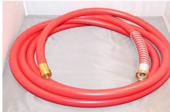
INJ-676 Heavy-duty red output hose with kink protector & brass fittings, 15'. HydroCart Max, serial number above 20111923